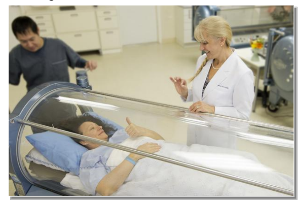
One of four hyperbaric chambers at BaroMedical

Proper hyperbaric treatment allows you to comfortably lay inside a see-through oxygen chamber completely surrounded with oxygen for 1½ hours while napping or watching TV.